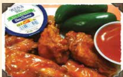
0g Trans Fat