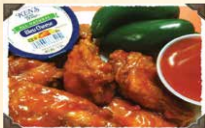
0g Trans Fat